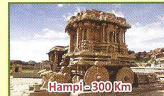
Hampi - 300 Km