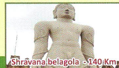
Shravana belagola - 140 Km