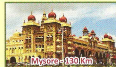
Mysore - 130 Km