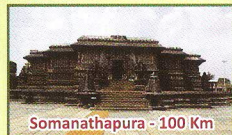
Somanathapura - 100 Km